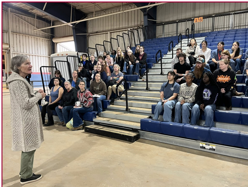
2026 Florida State Fair Youth Llama Show